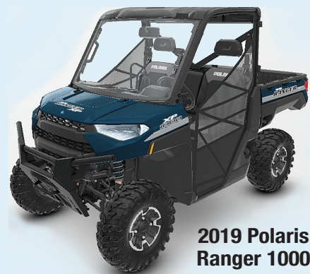
2019 Polaris Ranger 1000