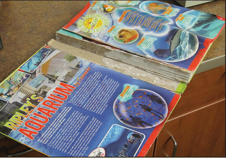
Book in need of repair.